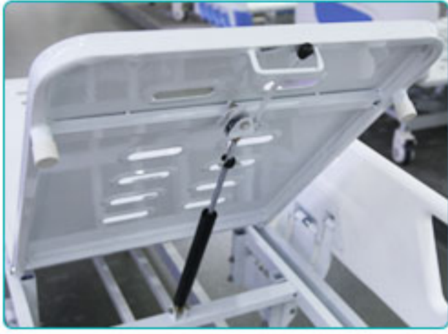
Gas spring Manual operate the back rest position