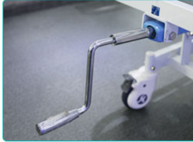
Crank Adjust trolley height