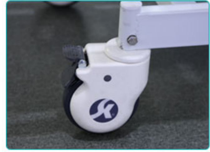
5" castors with brake Deluxe mute wheel